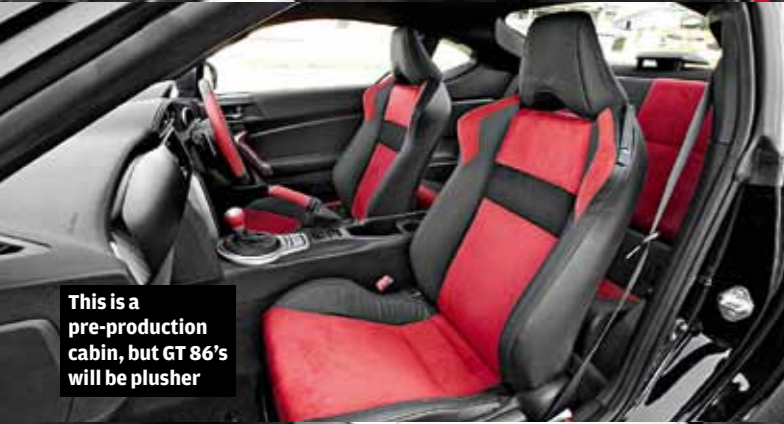
This is a pre-production cabin, but GT 86's will be plusher