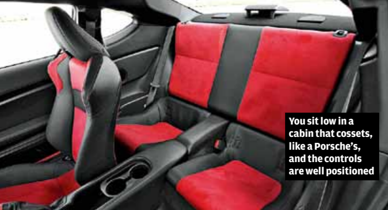
You sit low in a cabin that cossets, like a Porsche's, and the controls are well positioned