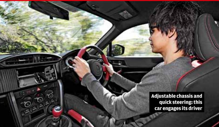
Adjustable chassis and quick steering: this car engages its driver

Turn in to a corner and there is some roll, but it's well contained. On a constant throttle and steady steering, it understeers slightly, but lift mid-corner or trail the brakes – or just throw it in – and it'll either straighten its line or flick to oversteer as you choose. There's fun to be had in either state, as the car steers delicately on the throttle or swings the tail willingly. Long drifts require a delicate use of momentum, though, because there simply isn't enough power to maintain a massive slide. →